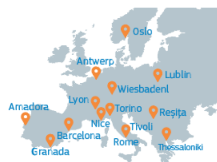
European cities participating at the event

More than 70% of the European population live in European cities, a share that is expected to grow to up to 80% by 2050. Cities and municipalities can be catalysts for the development of apprenticeships by bringing together key players across several levels: local, regional and national. One of the primary goals of the network will be to raise awareness of the potential that the cities have to support apprenticeships. Ultimately, through the network, cities will be able to learn from each other, collaborate, develop tools, share good practices and provide and receive technical and policy assistance.